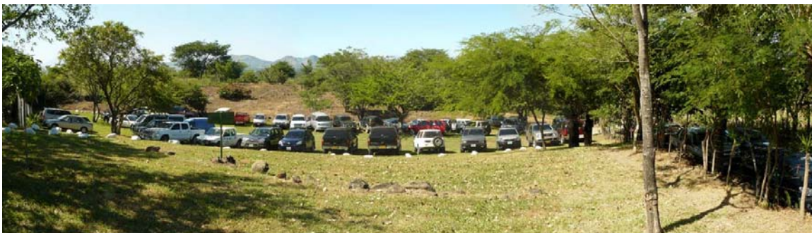
CIHUATÁN'S NEW PARKING AREA THE DAY OF THE INAUGURATION.

We in FUNDAR have invested ourselves wholeheartedly and full time in the job we are asked to do and we have made enormous strides in the protection of El Salvador's archaeological heritage. Until such time as other arrangements are set in place, we will continue to work closely with CONCULTURA and other archaeologists in El Salvador to maintain, improve, and increase in number the country's archaeological parks and to protect, however possible, the precolumbian and colonial heritage of the nation.