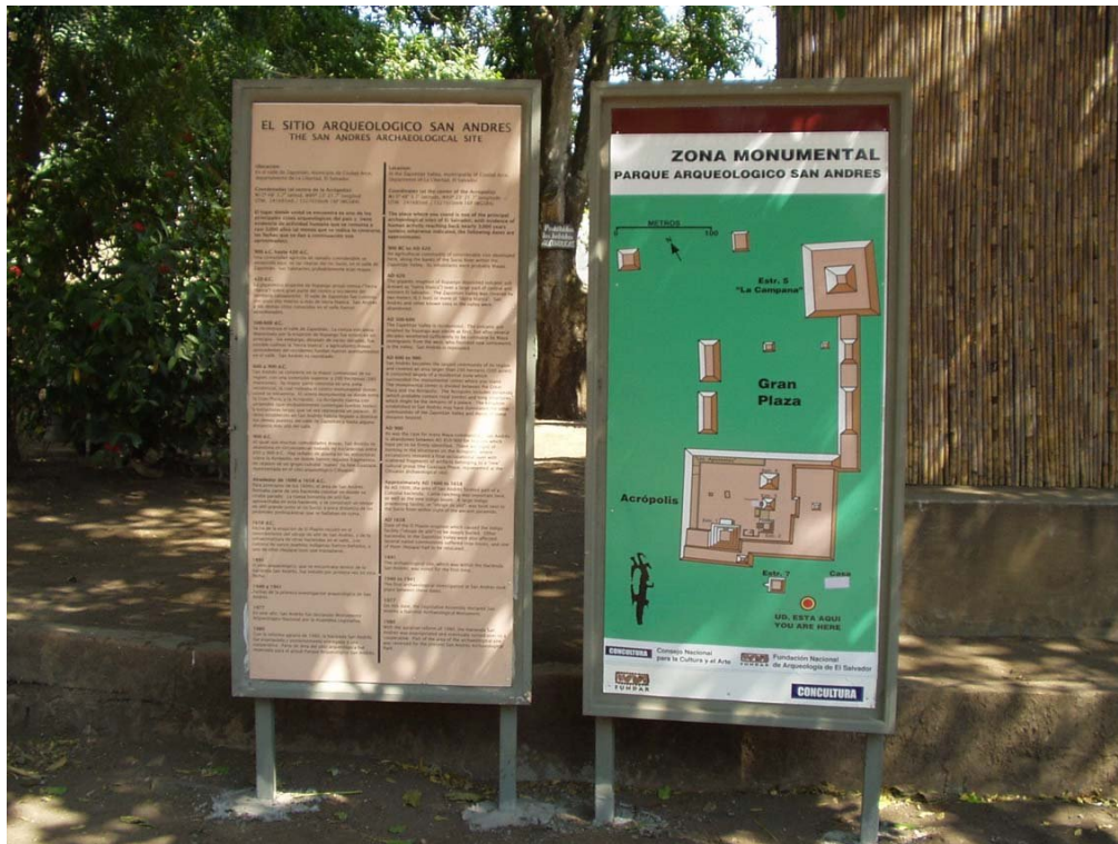
BILINGUAL SIGNAGE AND MAP OF THE RUINS AT ENTRANCE TO THE ACROPOLIS