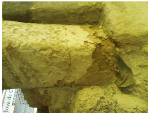
SEEPING WATER IN WALL BY STRUCTURE 3 AND WATER DAMAGE TO BRICKS IN STRUCTURE 10 AT TIME FUNDAR TOOK OVER PARK ADMINISTRATION.