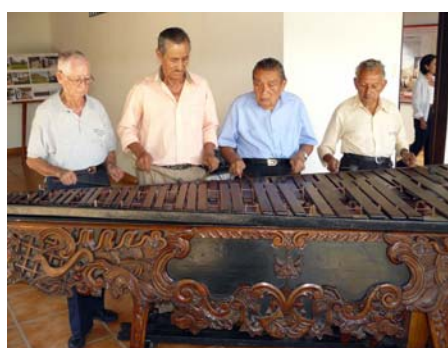
INAUGURATION OF THE CIHUATÁN ARCHAEOLOGICAL PARK: THE RENOVATED SITE HOUSE AND MUSEUM, DR. BRITO AND COMPANY AT THE OPENING OF THE MUSEUM, LADIES IN VOLCANERA COSTUME MAKE PURPLE CORN PUPUSAS (“PUPUSAS MAYAS™”) AND THE LOCAL TRADITIONAL MARIMBA.