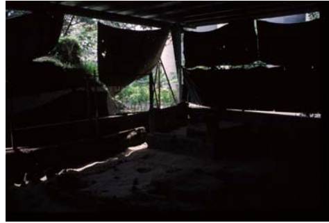
TWO VIEWS OF THE MAIN RUINS ENCLOSURE AT CERÉN, SHOWING RAGS HANGING ON THE CYCLONE FENCE TO “PROTECT” THE BUILDINGS FROM UV AND RAIN.