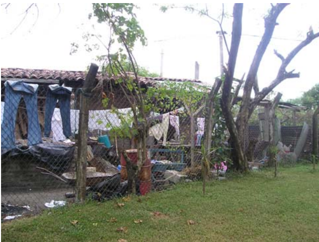
THIS VIEW OF OUR NEAREST NEIGHBORS HAS NOW BEEN OBSCURED BY PLANTINGS.