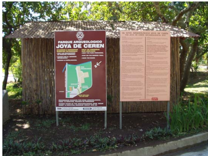
NEW ENTRANCE AND SIGNAGE AT JOYA DE CERÉN