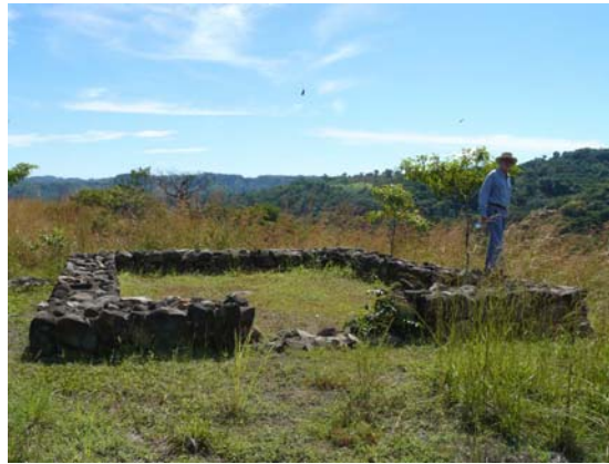
CIUDAD VIEJA: VIEWS OF A STREET, A BUILDING IDENTIFIED AS THE CABILDO AND ANOTHER WHICH SEEMS TO HAVE BEEN A LOOKOUT.