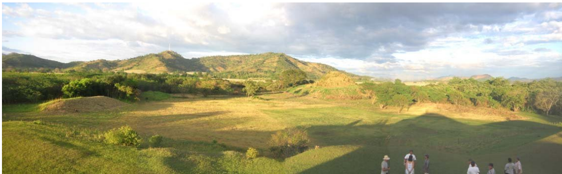
THE GREAT PLAZA AND CAMPANA BEFORE AND AFTER CLEARING OPERATIONS. BOTH VIEWS FROM THE SAME SPOT ON THE ACROPOLIS.