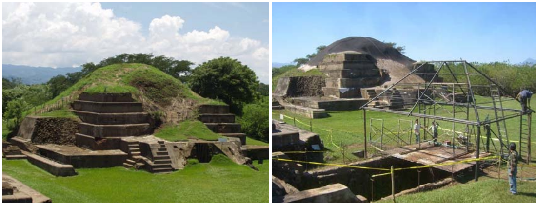
THE MAIN PYRAMID AT SAN ANDRÉS BEFORE AND DURING CONSERVATION ACTIVITIES. THE MEMBRANE HAS NOW BEEN COVERED WITH EARTH AND GRASS SO THAT THE PYRAMID REMAINS UNCHANGED IN ASPECT. THE STEEL FRAMEWORK IS A SHELTER FOR THE OPENING TO THE EXPLORATORY TUNNEL.