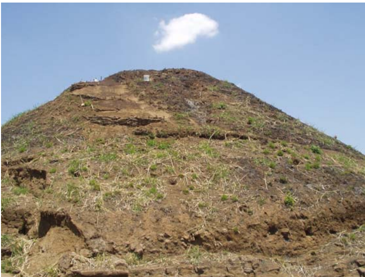
THE CAMPANA BEFORE AND DURING REPAIRS AND EROSION CONTROL. IT IS NOW PLANTED IN GRASS WITH A LOW FLOWERING GROUND COVER ON THE BASAL PLATFORM.